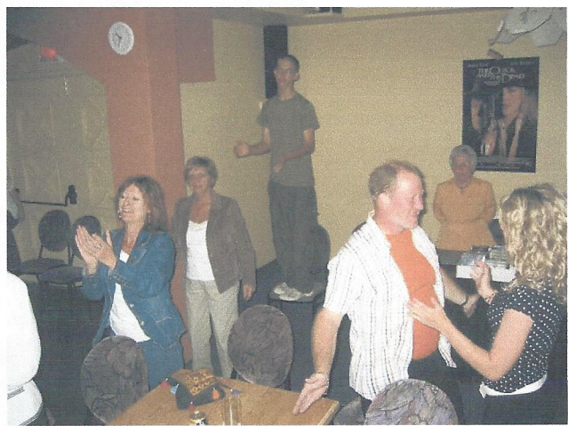
Everyone had a really good time. See you next year!