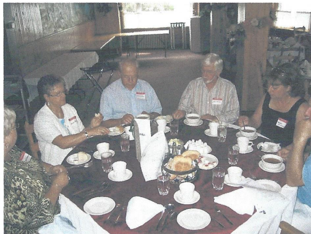
Good food at the Manoir des Laurentides.