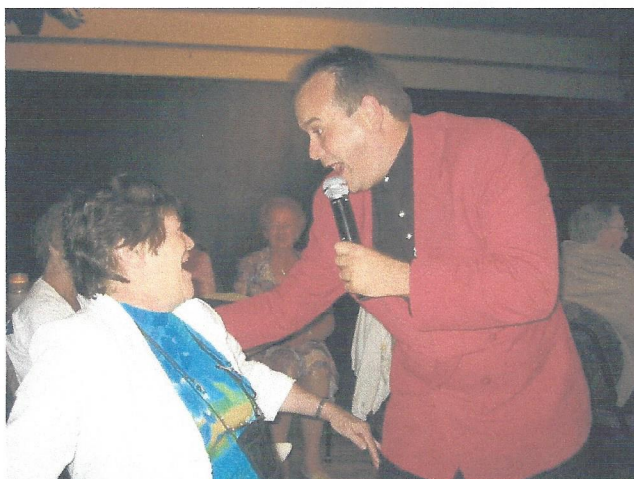
Sylvain Laporte made the public participate to his show.